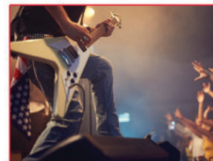
FESTIVALS & CONCERTS