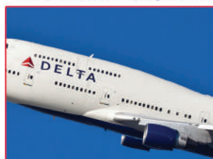
DELTA AIR LINES HEADQUARTERS