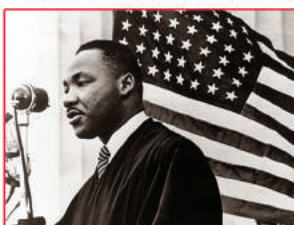
MARTIN LUTHER KING, JR. SITE