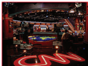
CNN WORLD HEADQUARTERS

HOME TO EXCITING ATTRACTIONS & MORE THAN A DOZEN FORTUNE 500 COMPANIES!