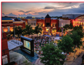
FANTASTIC SHOPPING CENTERS