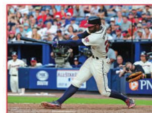
ATLANTA BRAVES BASEBALL

NONSTOP FLIGHTS TO MORE THAN 150 U.S. DESTINATIONS INCLUDING MIAMI, NEW YORK CITY, AND WASHINGTON, D.C.